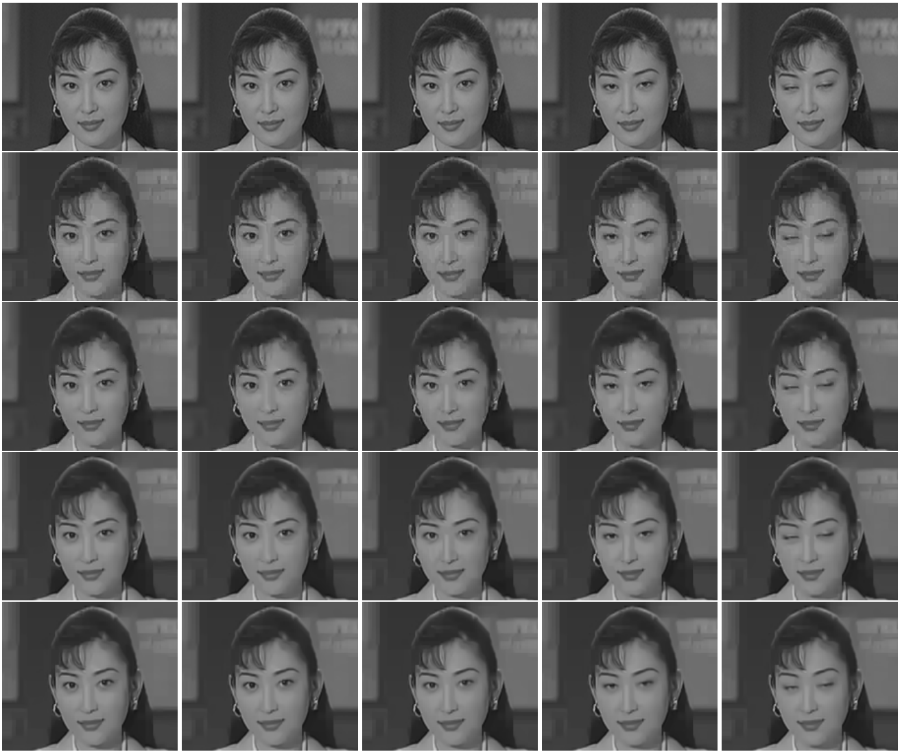
Fig. 3. Post-processing results of Akiyo video sequence (Frame No.1-5, QP = 37). From top to bottom: original frames, decoded frames, deblocked frames by the H.264 filter [2], deblocked frames by low-rank matrix completion deblocking method only and the deblocked frames by the proposed deflicker and deblocking method (DF+DB).